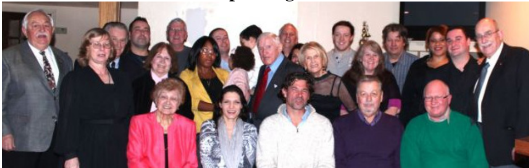
Several members of Wardrobe Lodge No. 555 and their guests enjoyed a festive gathering.