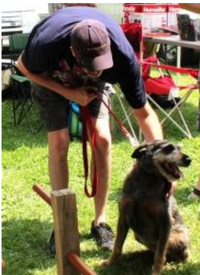
Furry- and feathered-friends joined in on the fun!