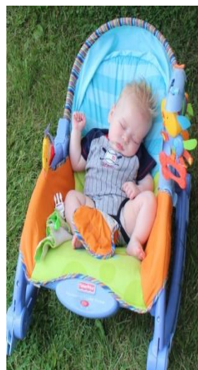
Some young participants found the day just too darn tiring.