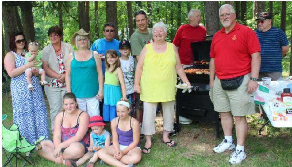
This group of participants seemed to have enjoyed the day.