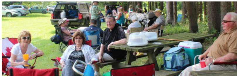
Brethren and their families relaxed in the shade.