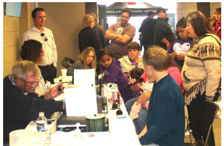
There was lots of interest at the Ancaster Fair.